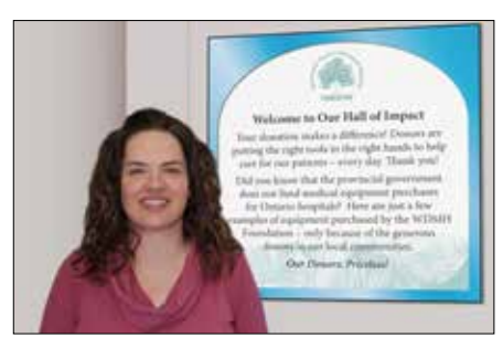
Thanks for your impact!

Not that long ago, I learned how a gift of life insurance would allow me to give the gift that I have always wanted to make for WDMH. Now, I have an inexpensive life insurance policy that will allow me make my largest gift ever for the hospital. It's a gift that I would never be able to make during my lifetime, no matter how much money I managed to save. To me, it's a win-win for the hospital and for me.